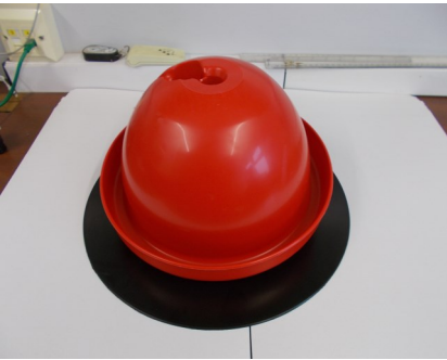
PLACE RED BELL OVER SPRING