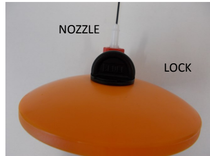
TOP OF DRINKER SHOWING LOCK

THE 6MM BLACK TUBING PUSHES ONTO THE WHITE NOZZLE ON THE TOP OF THE DRINKER.