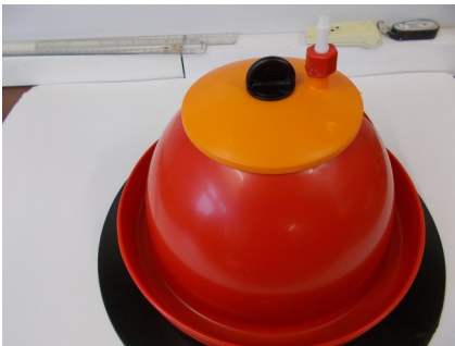
FINISHED DRINKER. THE BELL-SHOULD BE SPRINGY ON THE BASE