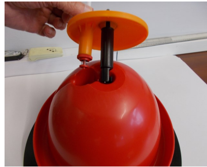
FIT DRINKER TOP AS SHOWN. PRESS DOWN, TURN CLOCKWISE TO LOCK 1/4 TURN .